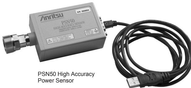
PSN50 High Accuracy Power Sensor

Total RSS Measurement Uncertainty (0 to 50° C): ±0.16 dB* Noise: 20 nW max Zero Set: 20 nW Zero Drift: 10nW max** Sensor Linearity: ±0.13 dB max Instrumentation Accuracy: 0.00 dB Sensor Cal Factor Uncertainty: ±0.06 dB Temperature Compensation: ±0.06 dB max Continuous Digital Modulation Uncertainty: +0.06 dB (+17 to +20 dBm)